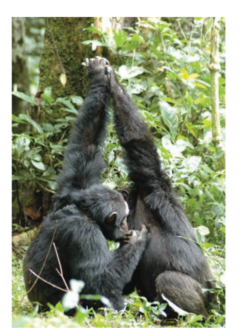
Fig. 6. Two adult male chimpanzees in Kanawara groom. Male chimpanzees participate in a variety of cooperative activities and form close social bonds.

izations of at least 100 other individuals (53); bottlenosed dolphins ( Tursiops aduncus ) form stable multilevel alliances (54); and rooks ( Corvus frugilegus ) console their partners after conflicts with other members of their flocks (55). For individuals in these species, there may also be important social components of fitness.